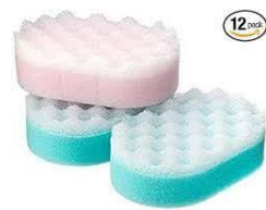
sponge / flannel